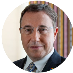
Achim Steiner Administrator, United Nations Development Programme & Co-Chair, Global Future Council on Economics of Equitable Transition

The green transition, driven by a rising urgency of accelerated climate action, is a transformative economic shift that impacts the production, distribution and consumption of goods and services with far-reaching and complex implications on equity, fairness and justice. Achieving net zero will encompass a wide range of changes: a clean energy system; the greening of agriculture, mobility and heavy industry; sustainable cities and infrastructure; and the scaleup of circularity models.